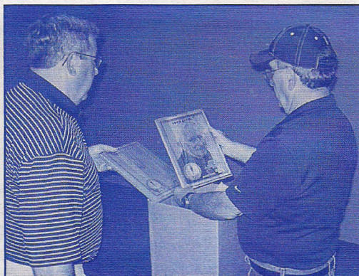
Examining the original plaques.